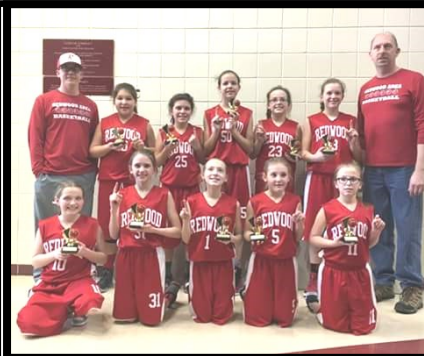
March 5 th , 2016 5 th Grade Girls Redwood Area Basketball Tournament-1 st

Change will not come if we wait for some other person or some other time. We are the ones we've been waiting for